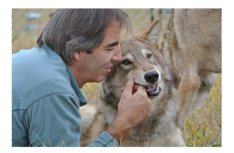
they are really amazing animals, and they are working for sausages. After every good take they get a piece of sausage. And of course I'm going to do that with the human actors also [laughs].

meet the wolves and I had storyboarded segments from the film where the wolves needed to act schizophrenic. And I thought we would have to do everything in separate shots, but he just brought in a big wolf and said "calm" and he just sat still looking into my eyes. And then he made a signal and it started to bare its teeth to me. And then another signal and it started to submit. So